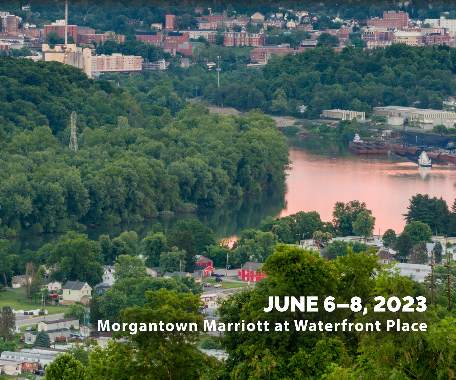
Exhibit & Sponsorship Opportunities